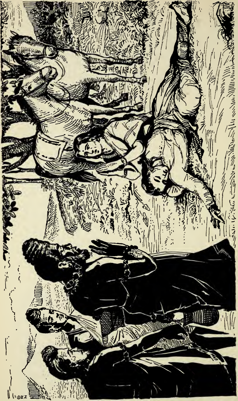
HIRA AND LAL